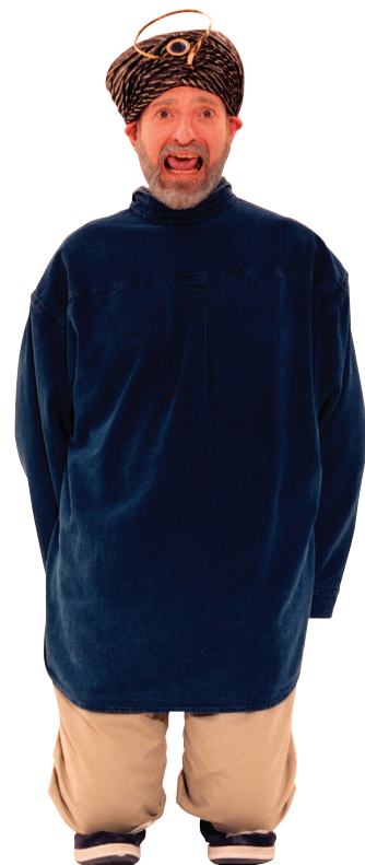
An alien-abductor on the prowl.